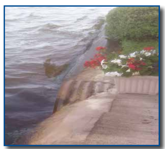
Figure 4. The inlet to Indian Lake, Cass County, Michigan as an example of a CSA.

itself (Figure 2), the drain field, and the soil. The tank is usually an impermeable substance such as concrete or polyethylene and delivers the waste from the home to the drain field. The sludge settles out at the tank bottom and the oils and buovant materials float to the surface. Ultimately the drain field receives the contents of the septic tank and disperses the materials into the surrounding soils. The problem arises when this material enters the zone of water near the water table and gradually seeps into the lake bottom. This phenomenon has been noted by many scholars on inland waterways as it contributes sizeable loads of nutrients and pathogens