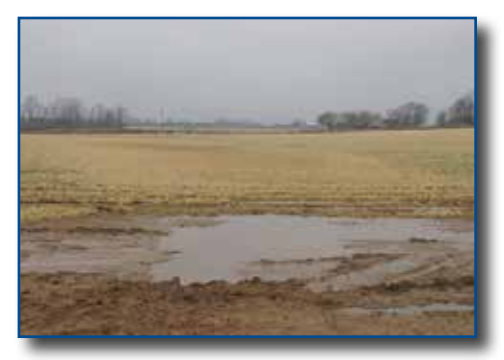
Figure 1. Ponded water on a farm that is likely to enter a nearby stream that flows into a lake.

Non-point source pollution (NPS) is the pollution caused when climatic events carry pollutants off of the land and into lakes, streams, wetlands, and other water bodies (Michigan Department of Environmental Quality). Unlike point source pollution which is derived from distinctive discharge pipes, NPS pollution is often diffused in nature. The diffusivity of NPS pollution creates challenges in determining the location of pollution sources which makes mitigation (treatments) a difficult and sometimes impossible NPS pollution is regulated task. by statute and includes categories such as agricultural source runoff (Figure 1) and confined animal feed operations (CAFO's), small urban runoff (populations with less than 100,000 residents), urban storm water runoff from unsewered areas, septic tanks, runoff from abandoned mines, land disturbing activities, and atmospheric deposition. Although regulation exists, it is difficult to regulate NPS pollution at both the federal and local levels. There has been considerable debate among scientists, engineers, and other